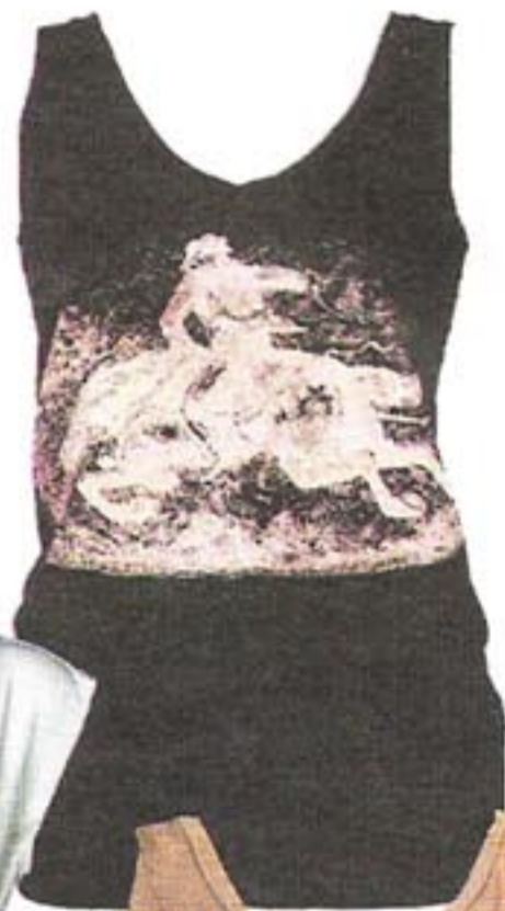
Barking Irons Washington Ride T-shirt (below), $68.