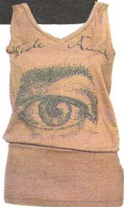
Barking Irons Wide Awake T-shirt (right), $68.