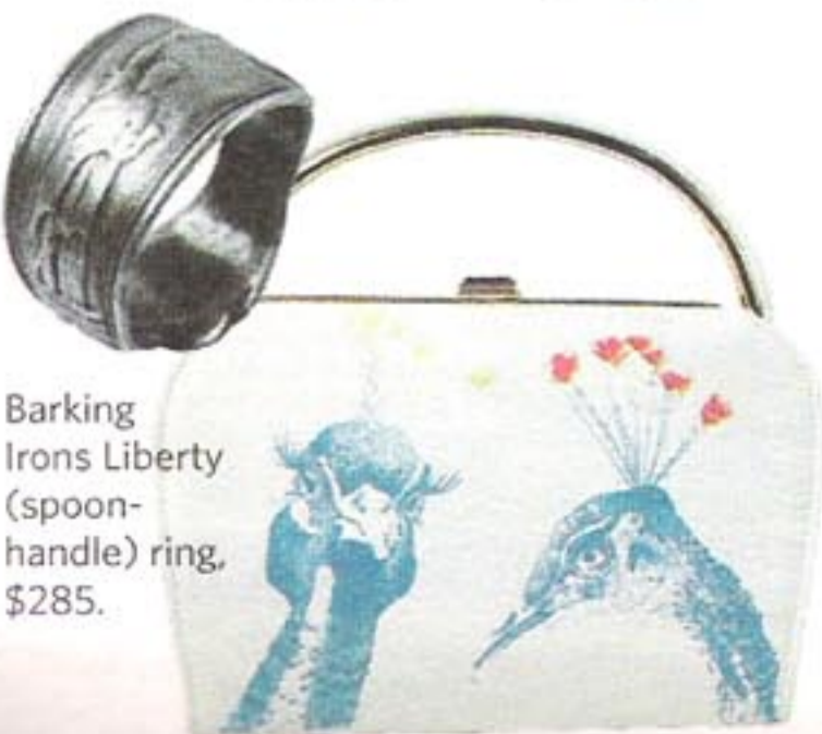
Barking Irons Liberty (spoon-handle) ring, $285.