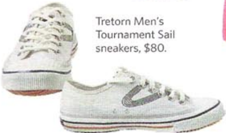
Tretorn Men's Tournament Sail sneakers, $80.