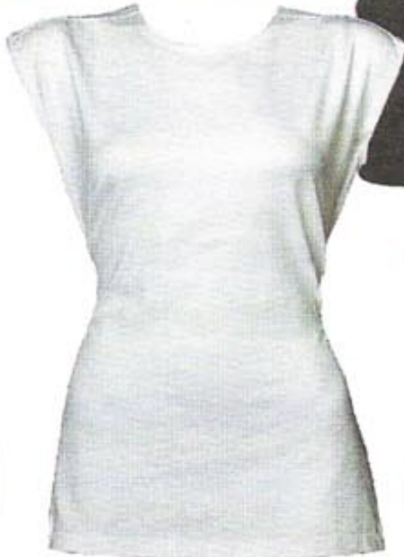
Warhol Factory x Levi's Kimono top (above), $80.