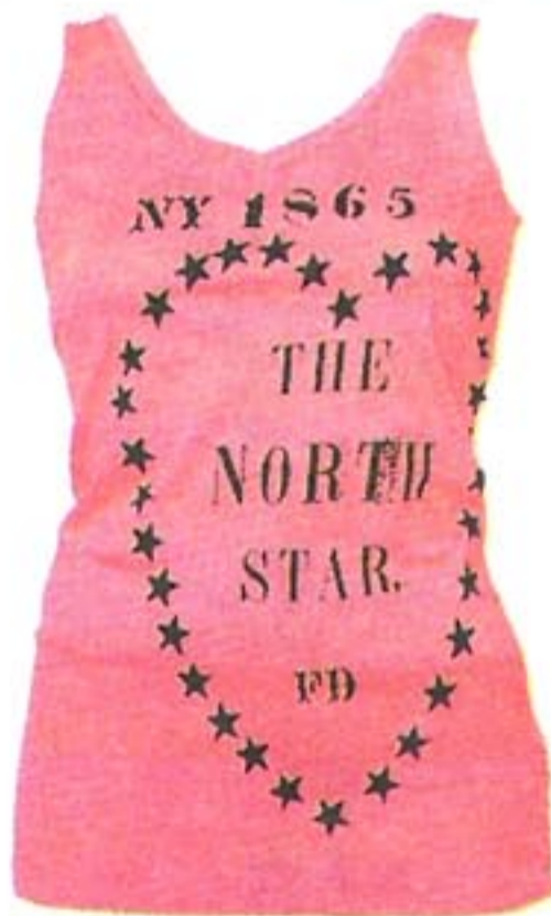
Barking Irons North Star T-shirt (left), $68.