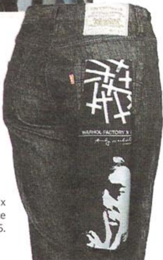
Warhol Factory x Levi's Cigarette jeans, $285.