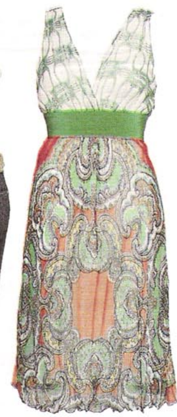
Bailey 44 dress, $303.