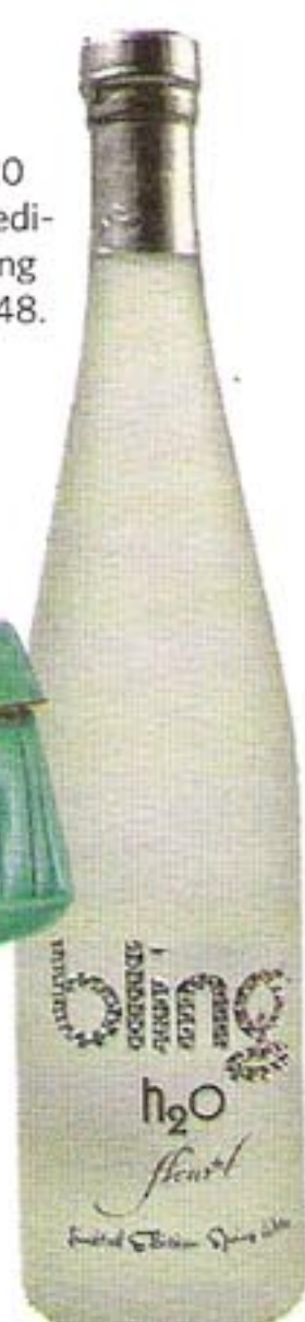
Bling H2O limited-edition spring water, $48.