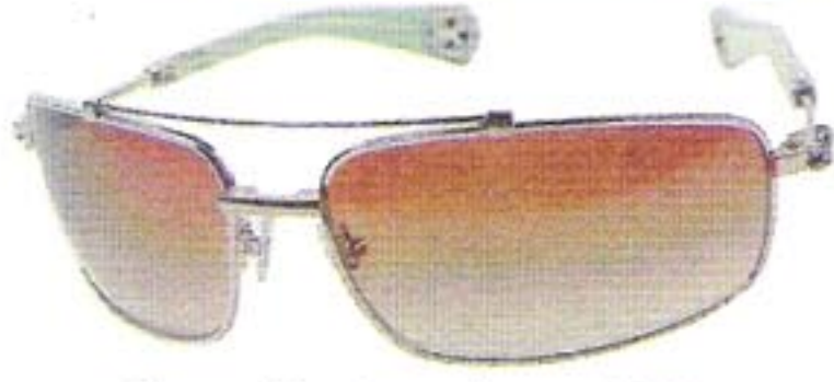
Chrome Hearts sunglasses, $895.

Details: 8877 N. Scottsdale Road, Scottsdale. Hours are 10 a.m.-6 p.m. Mondays through Thursdays, 10 a.m.-7 p.m. Fridays and Saturdays and 11 a.m.-5 p.m. Sundays. (480) 998-1637. shopfleur.com .