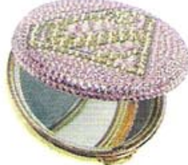
Supergirl crystal compact, $249.