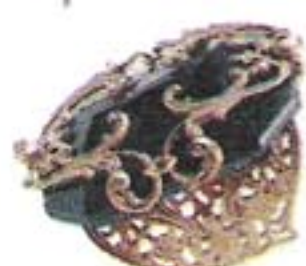
Gold and black scroll ring, $139.