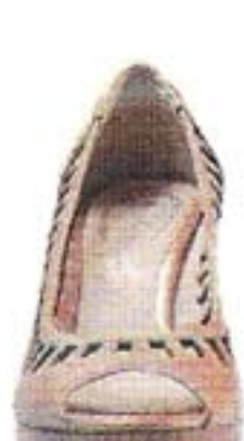
Modern Vintage bronze peep-toe heels, $196.