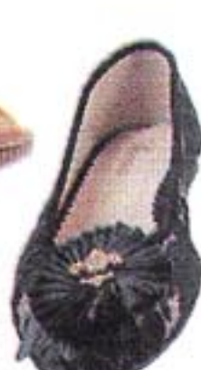
Candace Ang lace ballet flat with removable fleur-de-lis clip, $294.