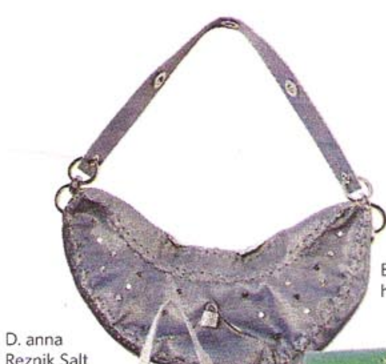
BéBU Adriana handbag, $420.