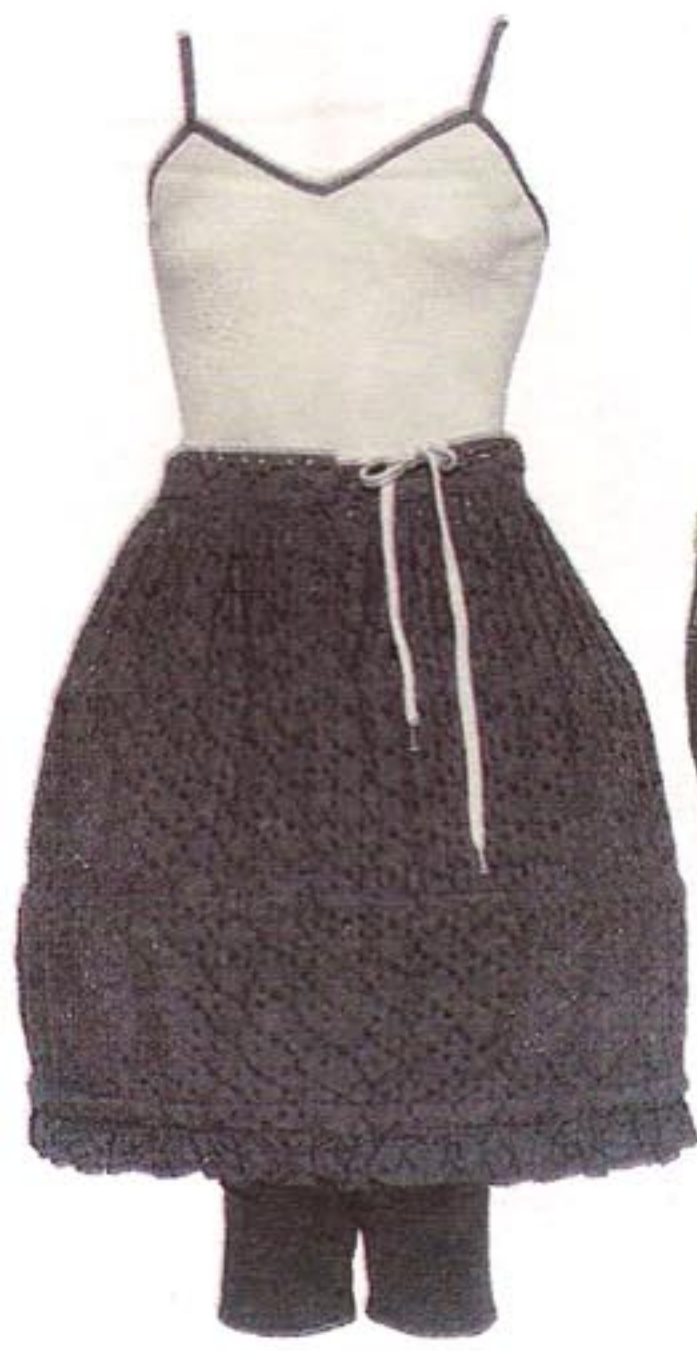
John Varvatos Converse tank, $145, Vivienne Westwood hoop eyelet skirt, $400, and Tarte leggings, $65.