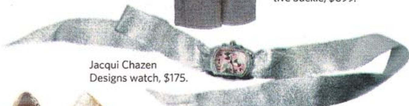
Jacqui Chazen Designs watch, $175.